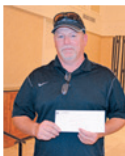
Grand prize winner of a $1,000 gift card: Cale Kids, Huber Engineered Woods