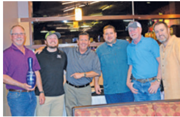
Division Champion: Metro East Division