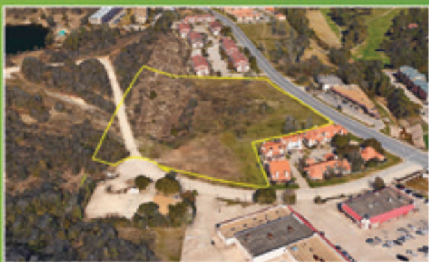
1050 WOODHAVEN, FORT WORTH MULTIFAMILY, 9.78 ACRES $915,000