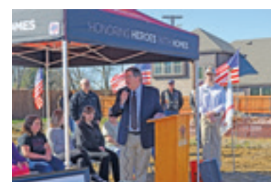
Congressman Michael Burgess makes remarks during the ceremony.