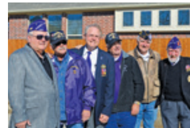
The Military Order of the Purple Heart was on hand.