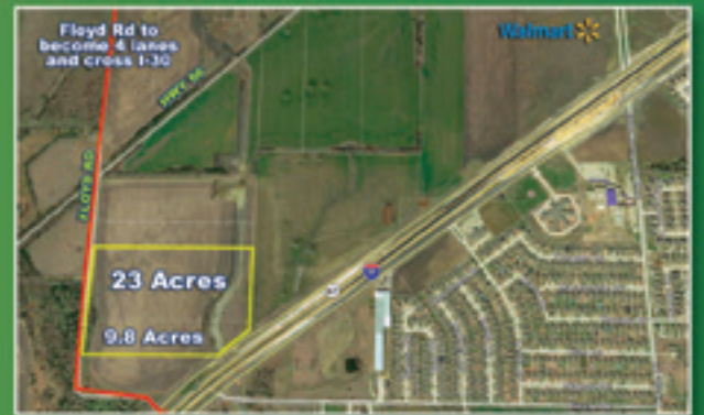
+/- 32.8 ACRES • ROYSE CITY I-30 FRONTAGE, COMMERCIAL $2,359,000