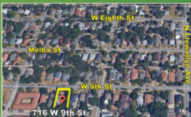
716 W 9TH BISHOP ARTS AREA ZONED MULTIFAMILY, 18,165' $450,000