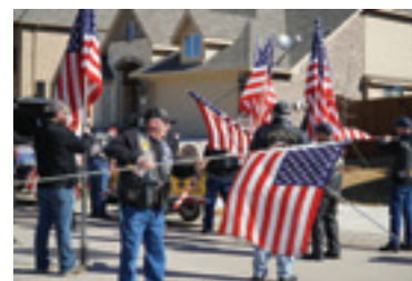
The North Texas Patriot Guard Riders provide a patriotic escort to the wounded veterans for all Operation FINALLY HOME ceremonies.

Donations of materials and labor are needed. Visit DallasBuilders.com for details.