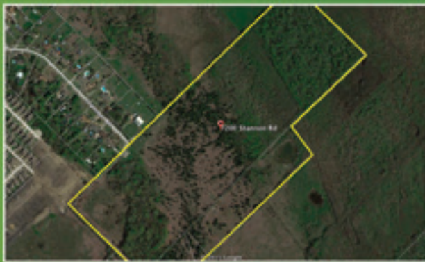
92 ACRES • MESQUITE, TX ZONED BUSINESS PARK $1,125,000