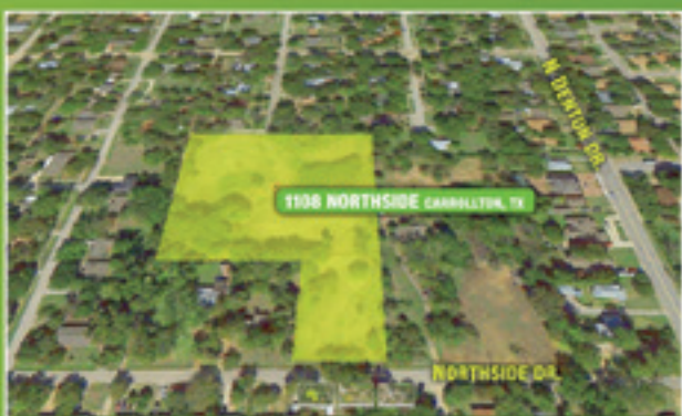
1108 NORTHSIDE, CARROLLTON +/- 4.33 ACRES, AG $1,100,000