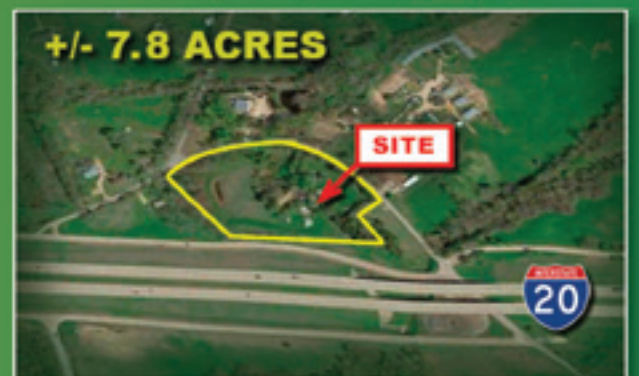
+/- 7.8 ACRES • MESQUITE, TX I-20 FRONTAGE WITH HOME $650,000

t2 REAL ESTATE - SPECIALIZED KNOWLEDGE WITH A HANDS-ON APPROACH