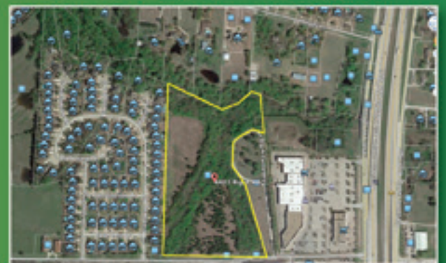
4401 BIG A RD. ROWLETT +/- 14 ACRES, SFH 9,000' LOTS $1,200,000