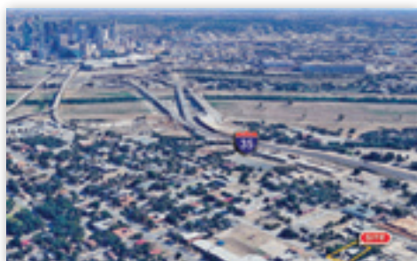
312 N LANCASTER, DALLAS ±100' X 183' UP TO 5 STORIES $450K