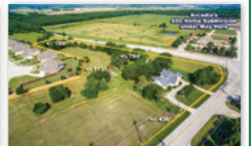
CHIESA / LIBERTY GROVE ROWLETT ± 5.5 AC. WILL SUBDIVIDE