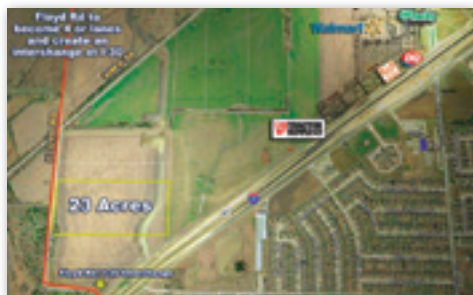
FLOYD RD, ROYSE CITY ± 23 ACRES BEST OFFER