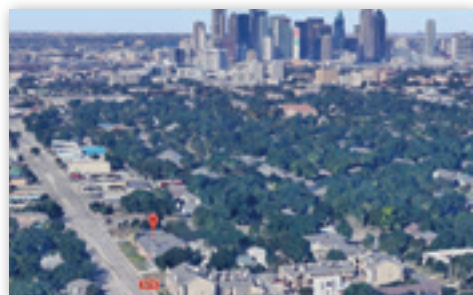
5223 COLUMBIA AVE · MF2 ± 65' X 170' $299K