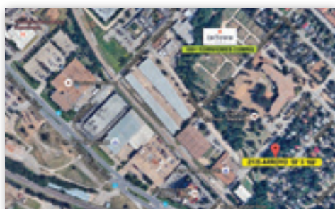
2135 ARROYO · $300,000 ± 50' X 168' ZONED MF2