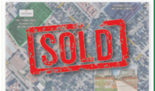
4501 AFTON RD, DALLAS · MF2 ± 90' X 150' SOLD!