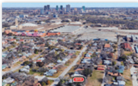
3851 LAFAYETTE, FORT WORTH MUSEUM AREA · BUILD UP TO 3 UNITS $295K