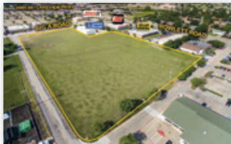
5610 BIG A RD. ROWLETT ± 4.52 ACRES · TX - $699K