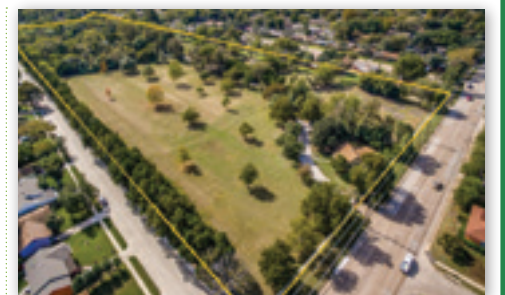
2040 W MILLER RD, GARLAND ±15 ACRES · SINGLE FAMILY