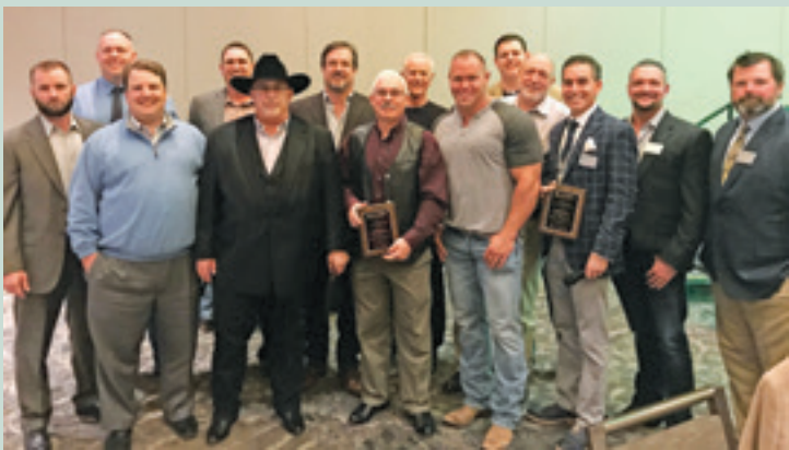
The Multifamily Builders Council Board of Directors