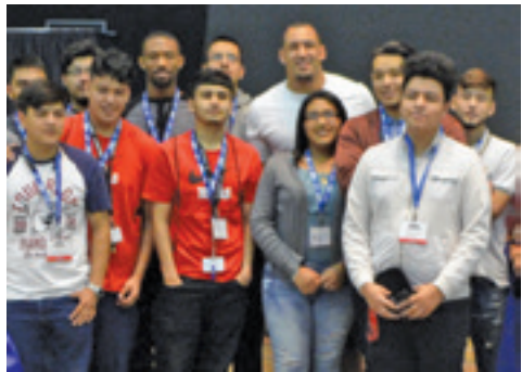
Cowboys defensive end Tyrone Crawford visited the Dallas Builders Show in October, mingling with area building trades students.

With more than 500 entries and 600 attendees, the ARC and McSAM Awards each took a step forward in 2017 thanks to hard work from Misty and the event committees. These events showcase the best of our industry and are always among my favorite to attend.