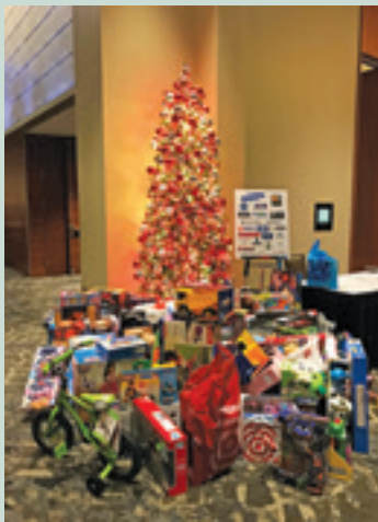
Holiday Party guests brought almost 200 toys and $500 in cash for donation to the local Toys For Tots chapter.