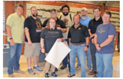
Several wounded combat veterans and recipients of Operation FINALLY HOME mortgage-free homes joined Dallas BA members for the Big Shot Shootout at the Frisco Gun Club.

is still hard to go to an After Hours or membership meeting without seeing him standing there shaking hands, smiling and making introductions.