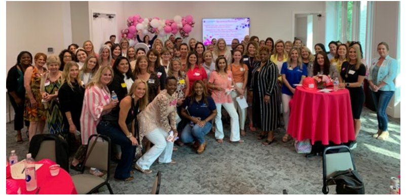
Members gather for a group photo at the June 9 Wine & Sign event hosted by the Association's Professional Women in Building Council.

Regular meetings are planned for the third Wednesday in September, Oc-