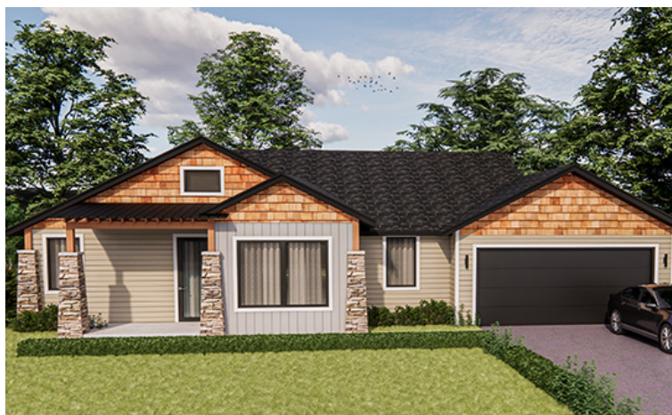
Garvey Homes is serving as Builder Captain for the Dallas BA's ninth Operation Finally Home project in Irving.