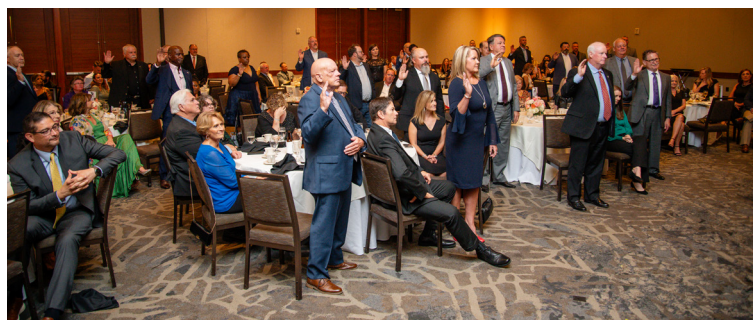
The Association Board of Directors and the Boards of its divisions and councils are installed en masse.