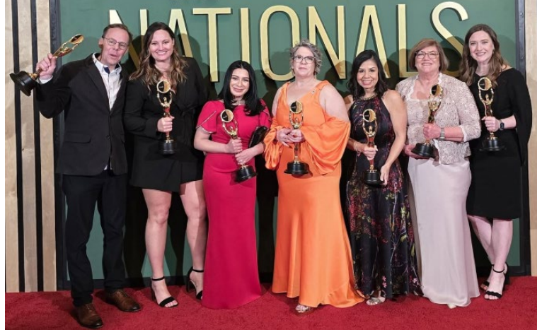
Representatives of Hillwood Communities and their associate partner Anderson Hanson Blanton celebrate the company's seven Gold Awards at The Nationals Feb. 25 in Las Vegas.