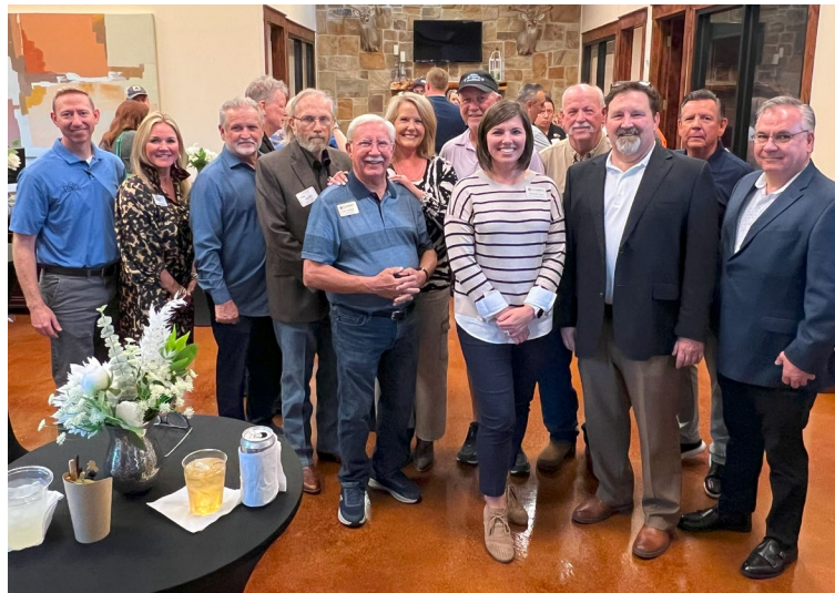
Metro East Division members enjoy a March 27 happy hour in Rockwall.