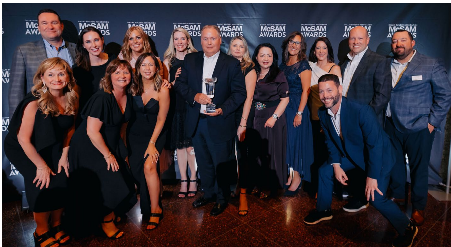
David Weekley Homes was named People’s Choice Builder of the Year at the 2025 McSAM Awards presented by LP Building Solutions. The event was held April 26 at The Statler Hotel in Dallas.

The People’s Choice competition rewards builders