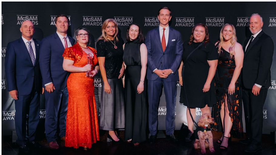
Hillwood Communities took 2025 McSAM Awards Developer of the Year honors. See more photos inside.