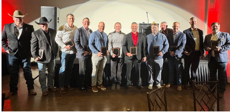
Members of the MFBC Board of Directors are recognized at the council's December holiday party Dec. 9 at Vouv in Dallas.