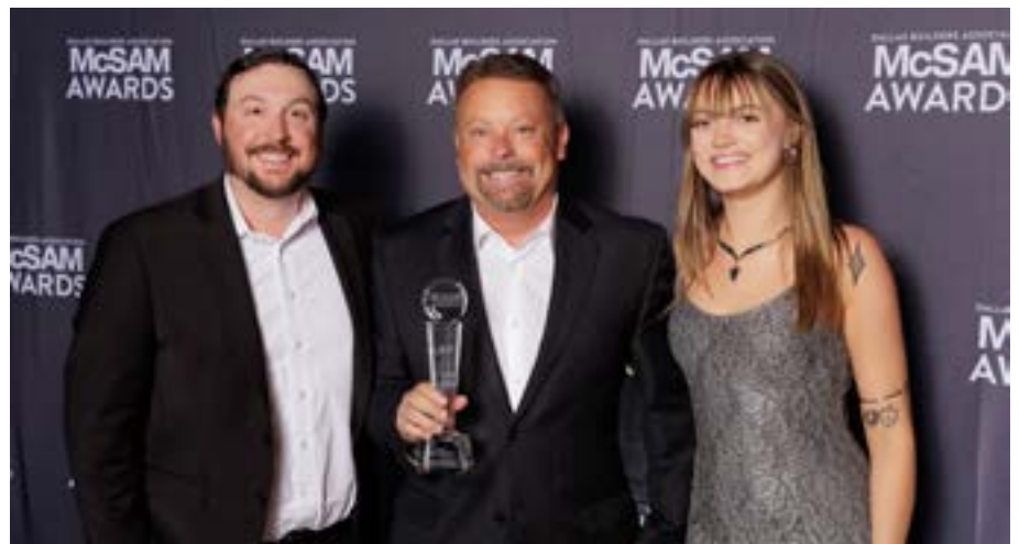
Ligenfelter Luxury Homes took the 2026 McSAM Awards Custom Home of the Year honor.

architects, interior designers and new home marketing professionals judged the awards.